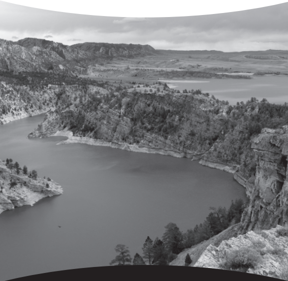
Seminole State Park is administered by the Division of State Parks, Historic Sites and Trails; Wyoming Department of State Parks and Cultural Resources.

Seminole State Park offers excellent fishing, boating, hiking and wildlife-viewing opportunities.